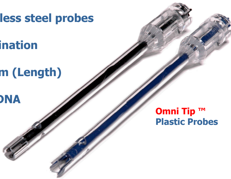
Omni Tip™ Plastic Probes

Versatile Omni Tip™ Probes are available in both soft tissue (deaggregation) and hard tissue (frozen) versions. Engineered from durable plastics, Omni Tips™ are reusable (autoclavable) and are so economical they can be disposed of after each use to eliminate cross contamination. The Omni Tips' patented design eliminates the hassle of disassembly and maintenance of traditional stainless steel generators. Treatable volume - 250 µL to 30 mL.